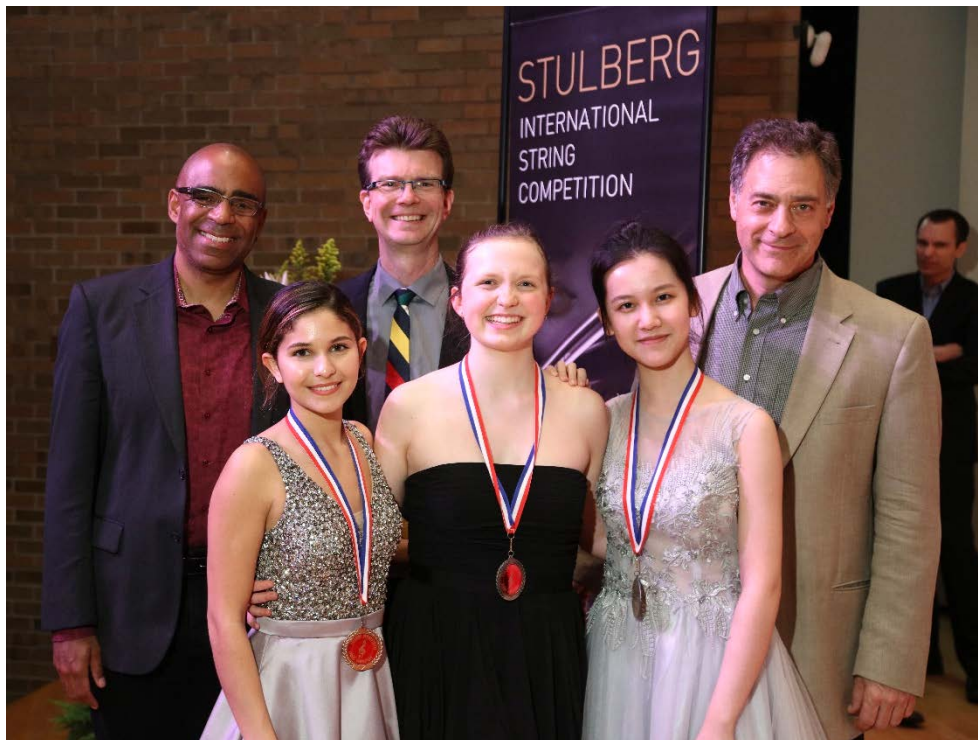
2018 Stulberg Judges & Medalists:

Deepen community engagement while offering a premier string competition.