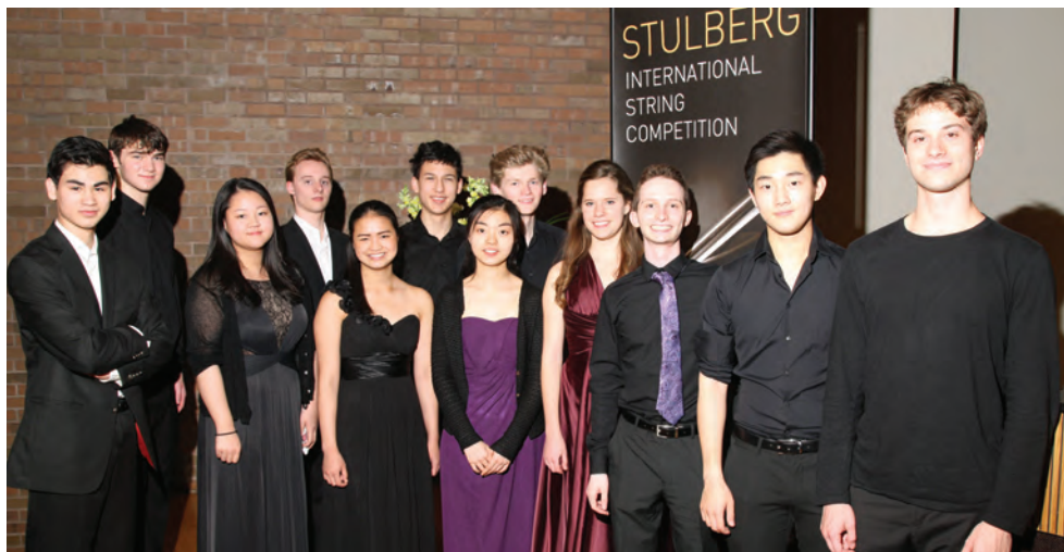
2016 Stulberg Competition Semifinalists

Support for the Stulberg International String Competition may be sent to Stulberg Competition, The Epic Center, 359 S. Kalamazoo Mall, Suite 14, Kalamazoo, MI 49007 .